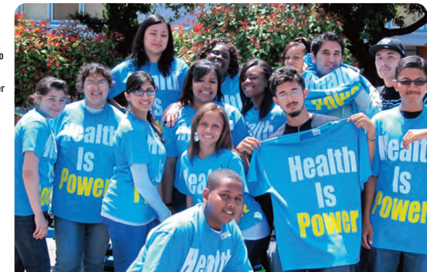
Youth health promoters from Tiburico Vasquez Health Center in Hayward.