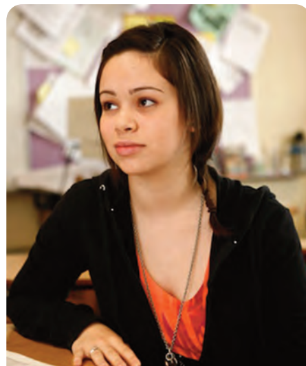
Women attending computer training class at Somos Mayfair in San Jose.