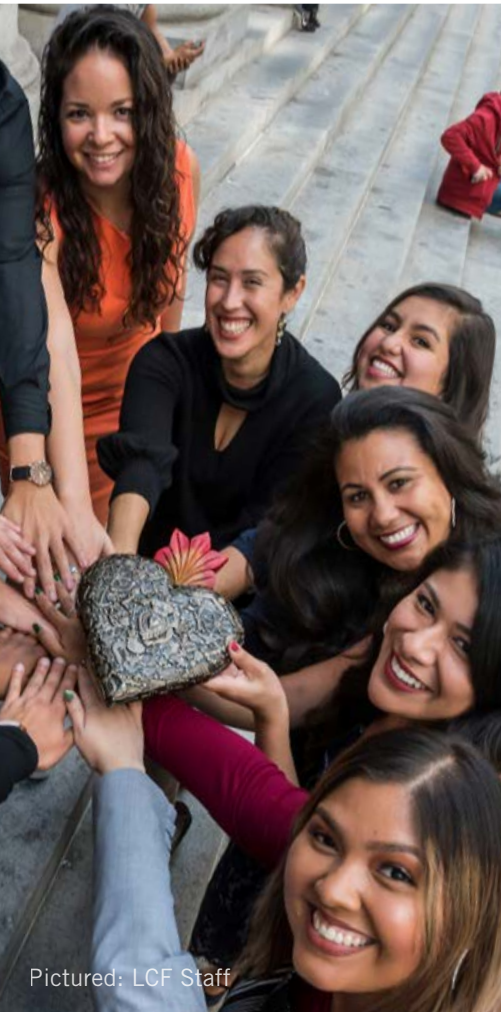
Pictured: LCF Staff

“Latino Community Foundation leads with love, and love is justice.”