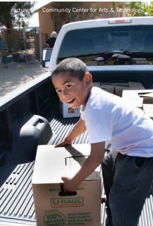
Pictured: Community Center for Arts & Technology

“Reopening California must go hand-in-hand with reinvesting in Californians. California’s Latinos play an essential role in the state’s economy, its communities, and its culture. During this past year, LCF and its local partners helped to deliver vital information and support to Latino families across the state. With LCF’s continued leadership and investment, we can secure a healthier future for them as well.”