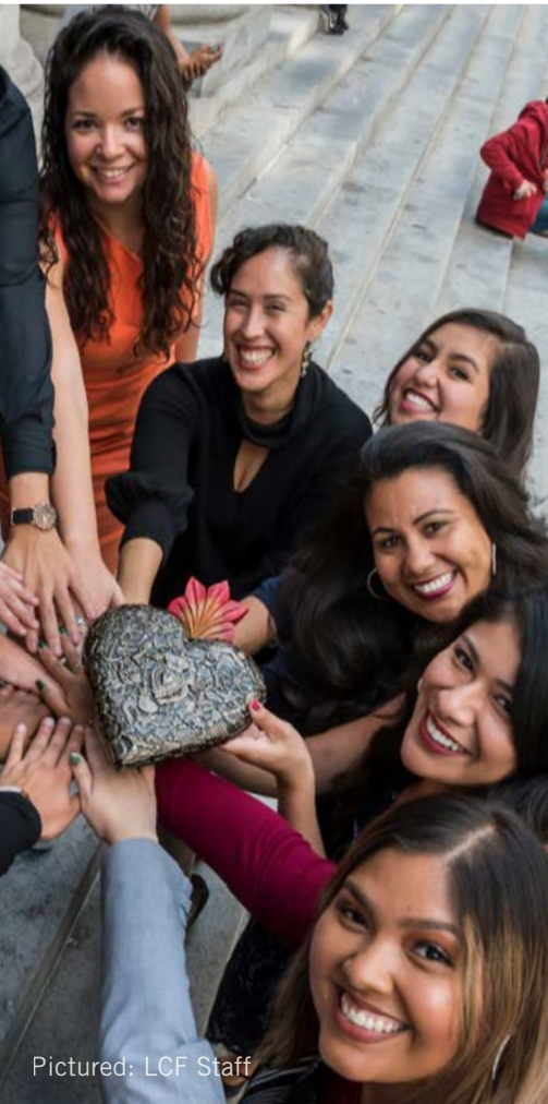
Pictured: LCF Staff

“Latino Community Foundation leads with love, and love is justice.”