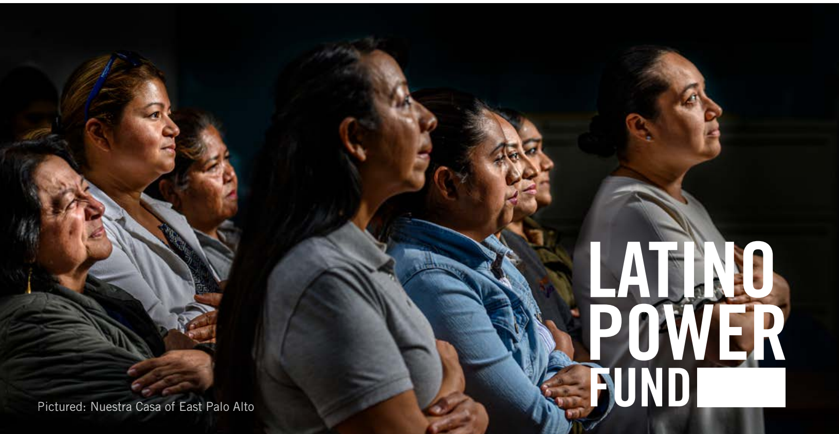
Pictured: Nuestra Casa of East Palo Alto