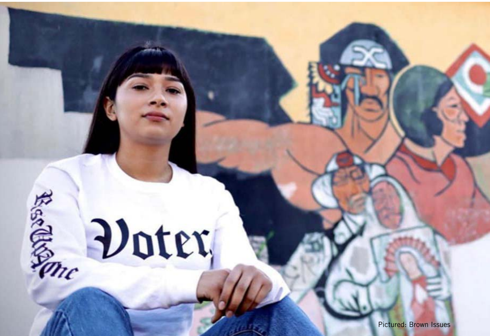
Pictured: Brown Issues

“We cannot return to normal. We need aspirational recovery, not a retrospective recovery going back to a situation that was not good for our people.”